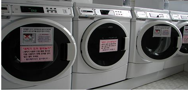
< Laundry Room >